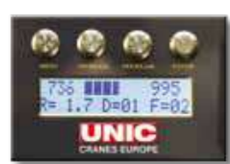
Optional full safe load indicator