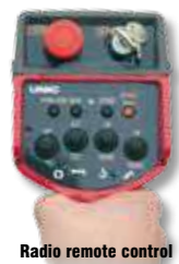
Radio remote control