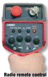
Radio remote control