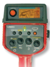
Optional radio remote control with digital feedback