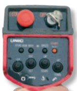
Standard radio remote control